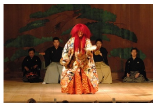
Stone lantern & noh