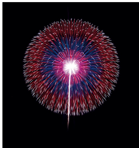
12-inch triple-pistiled crimson-silver