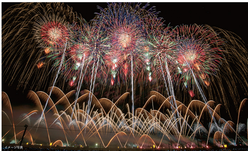
Wide starmine over the Omono River

*Displays will proceed in the event of rain. However, displays are subject to postponement or cancellation in the event of weather conditions that endanger the audience. Refunds are not available in the event the displays proceed.