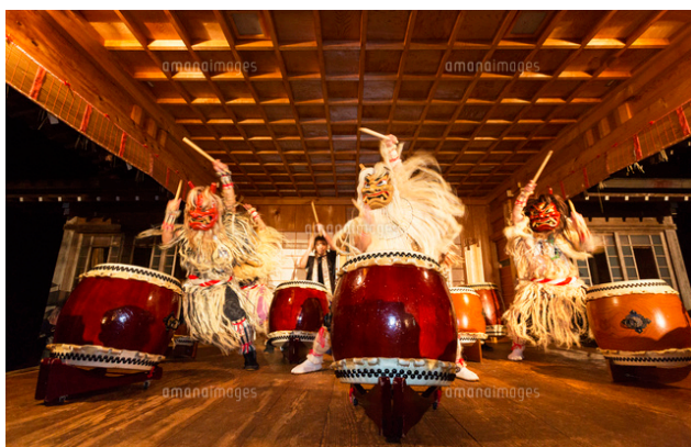
Oga Namahage-daiko performance

To welcome everyone to Omagari, there will also be a display of fireworks by local companies.