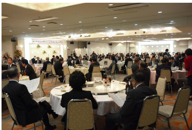
Grand Palace Kawabata Dining Hall

*Due to capacity of the dining halls and the necessity to use two adjacent rooms, seating must be allocated in advance . Seating may be selected at the Omagari Civic Centre in the order of registration from April 23 (Sunday), 12:30 .