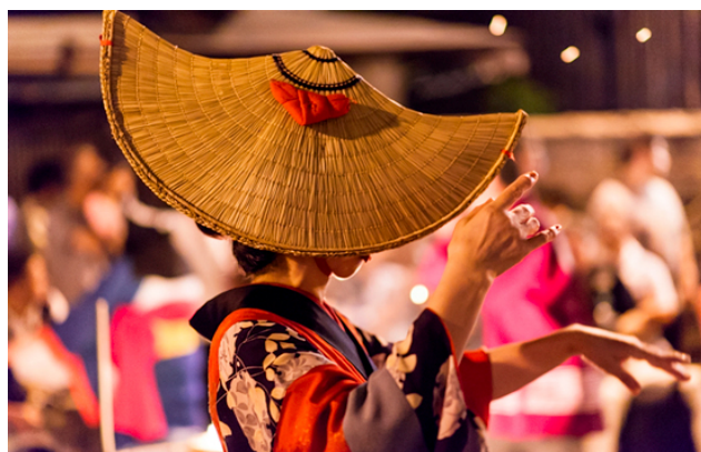
Nishimonai Bon-odori performer with an amigasa Hat