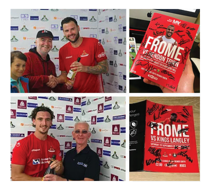
10% discount to any existing partners looking to purchase a matchday sponsorship.

*If you wish to invite additional people get in touch with us prior to any bookina.