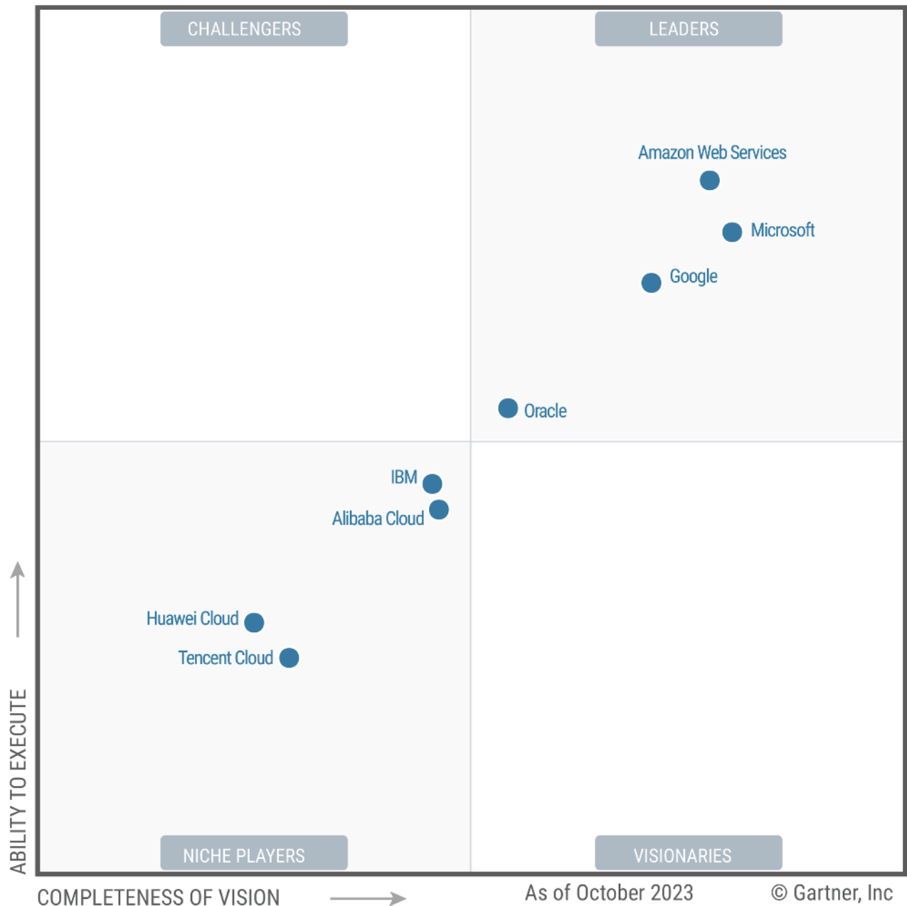
Figure 1: Magic Quadrant for Strategic Cloud Platform Services

The figure below shows how AWS earned the highest placement for Ability to Execute and furthest for Completeness of Vision in Gartner's Magic Quadrant for Cloud Infrastructure as a Service (IaaS):