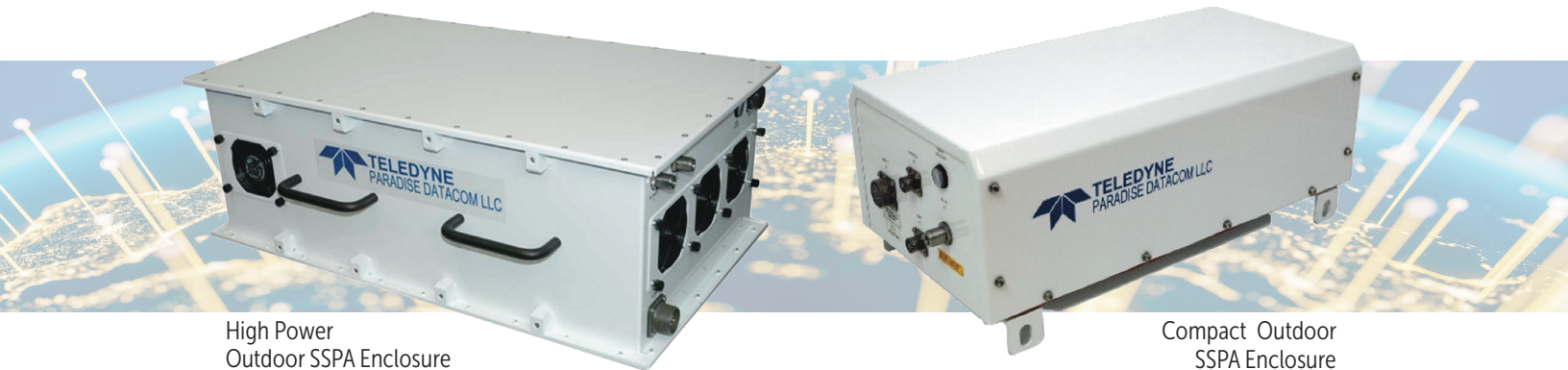
High Power Outdoor SSPA Enclosure