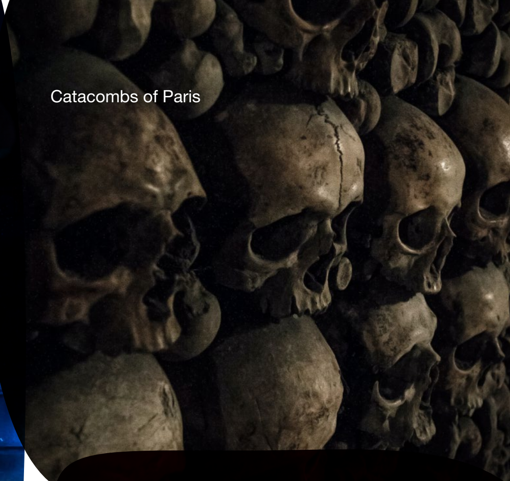
Catacombs of Paris