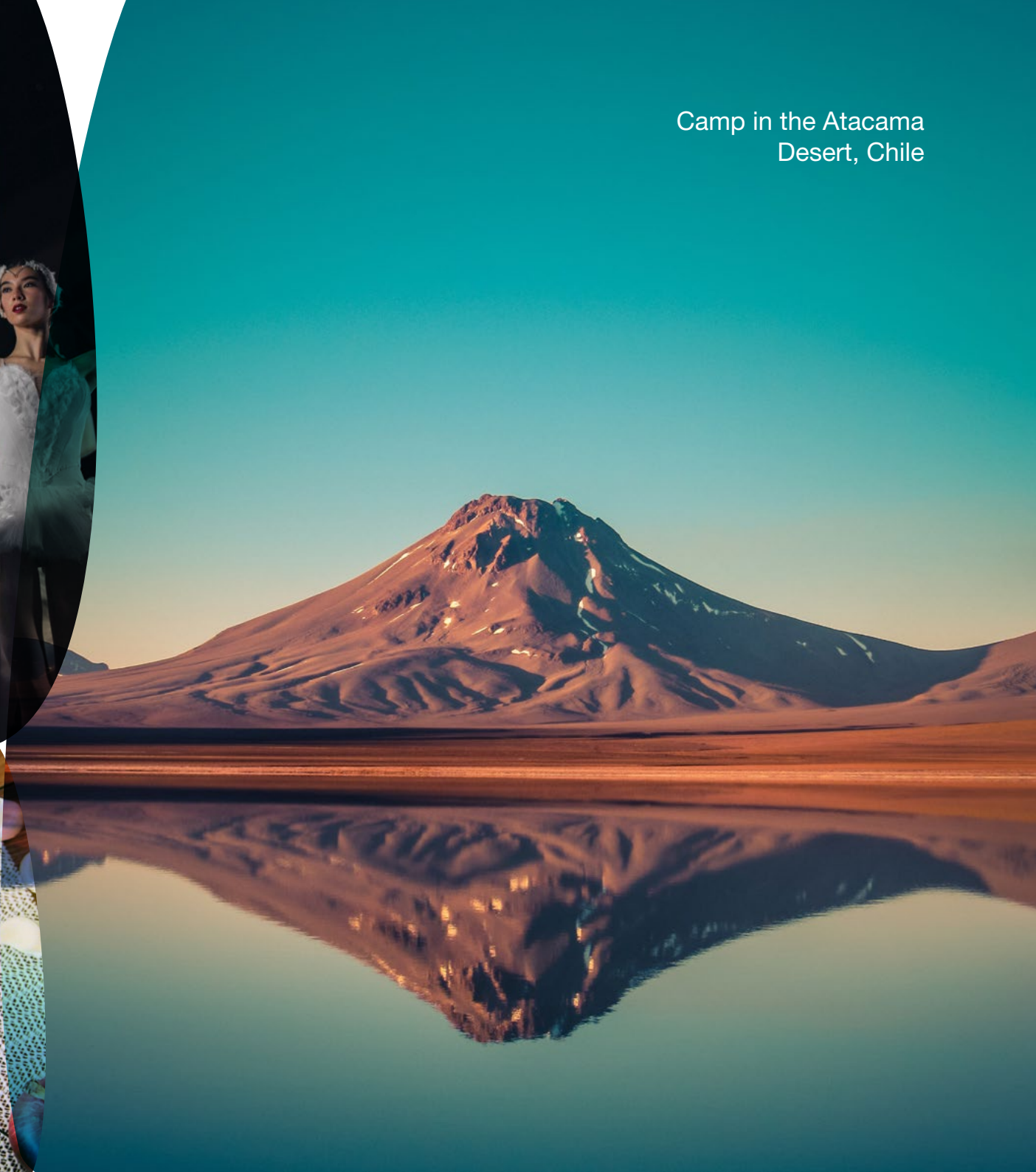
Camp in the Atacama Desert, Chile