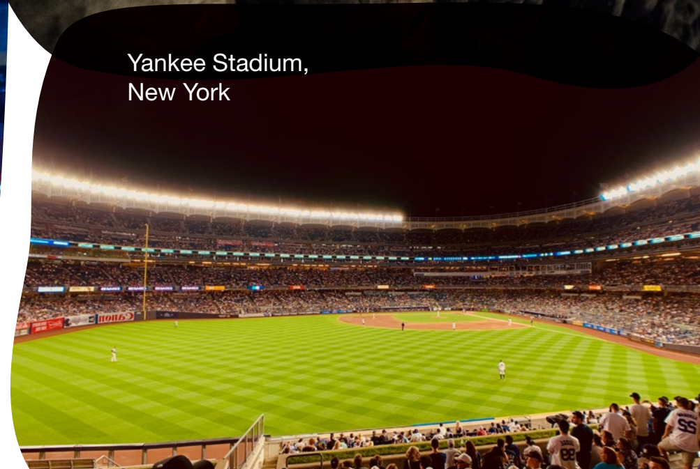
Yankee Stadium, New York