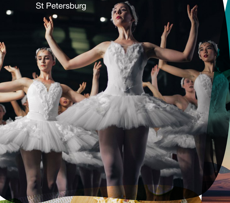
Ballet in St Petersburg