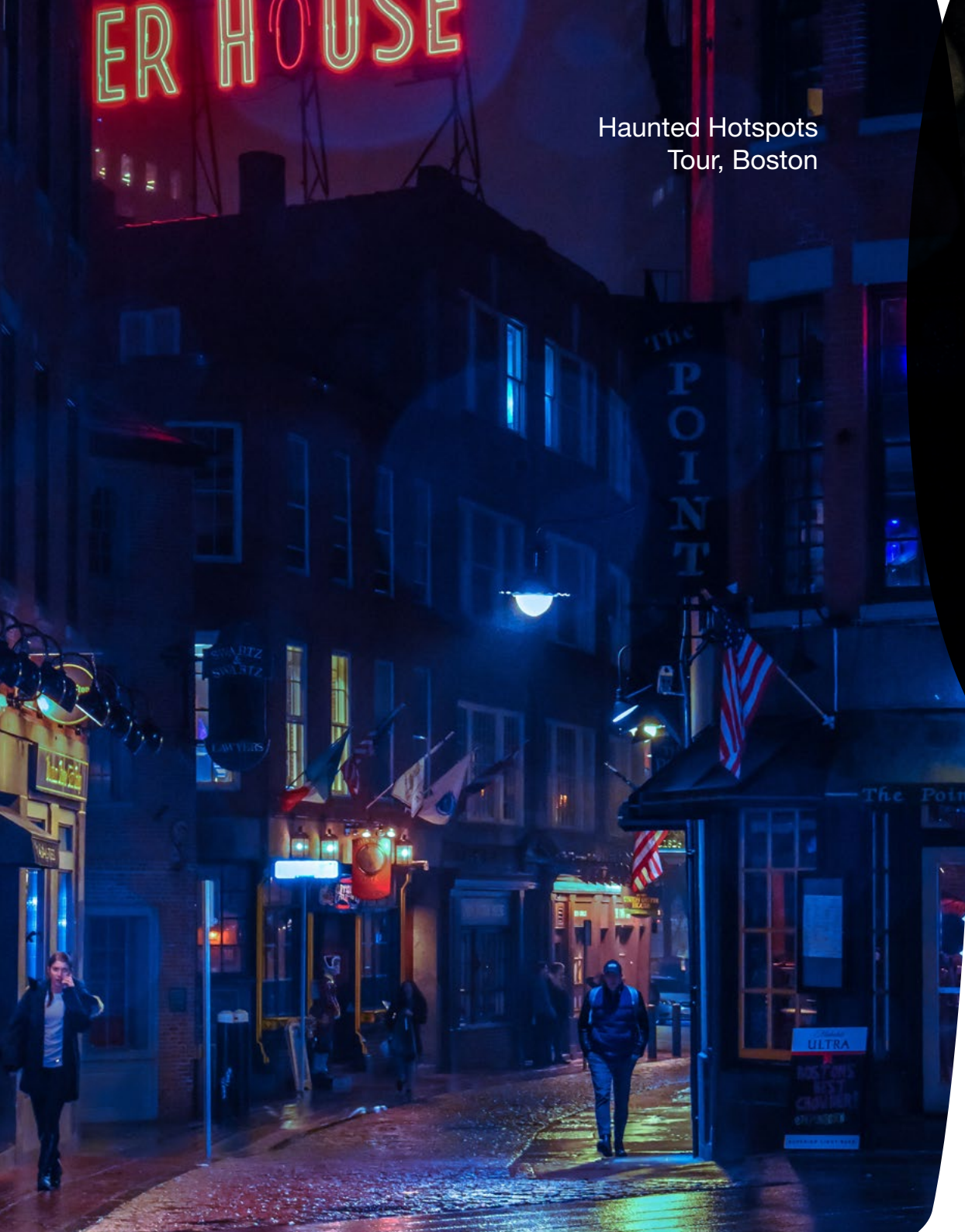
Haunted Hotspots Tour, Boston