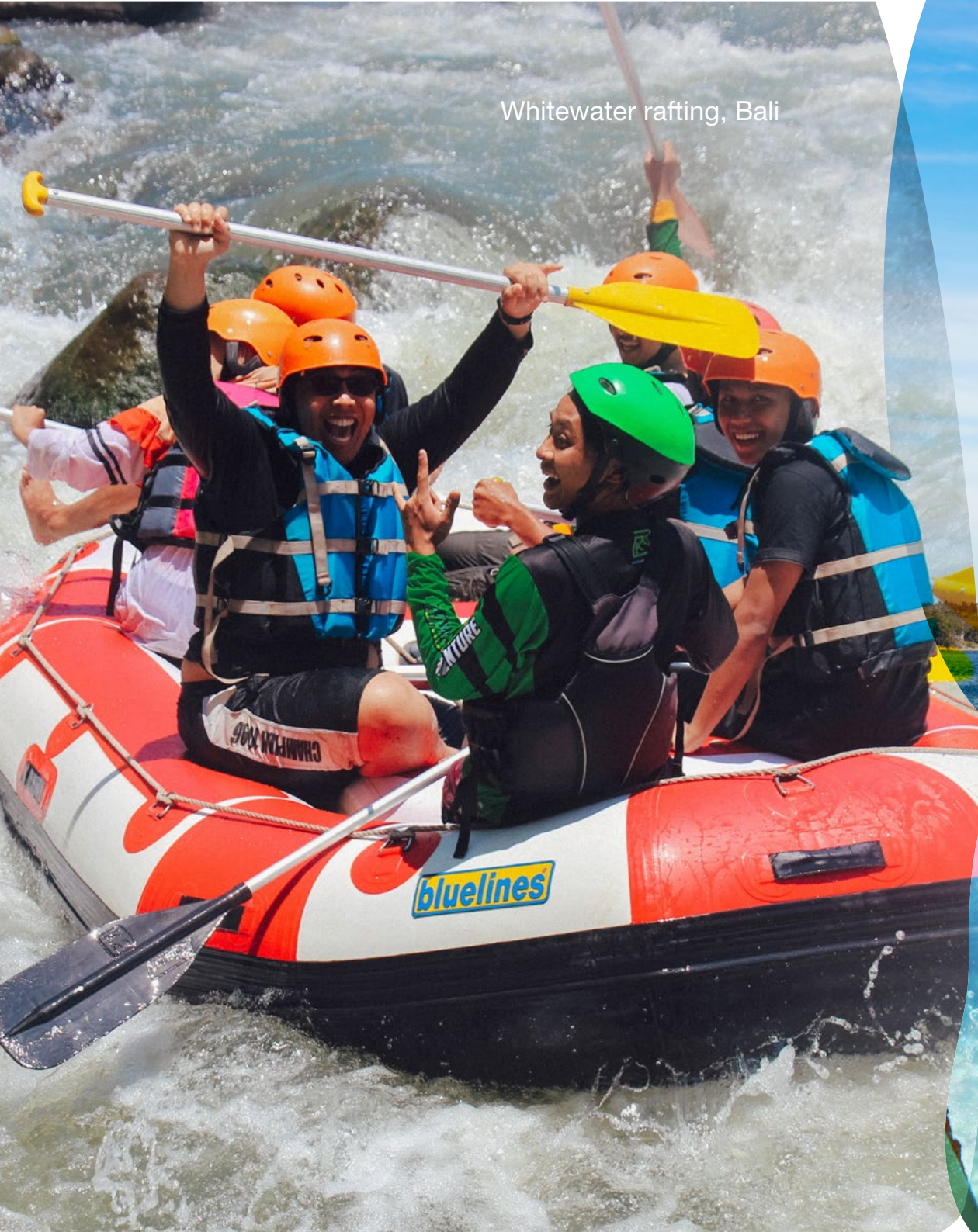
Whitewater rafting, Bali