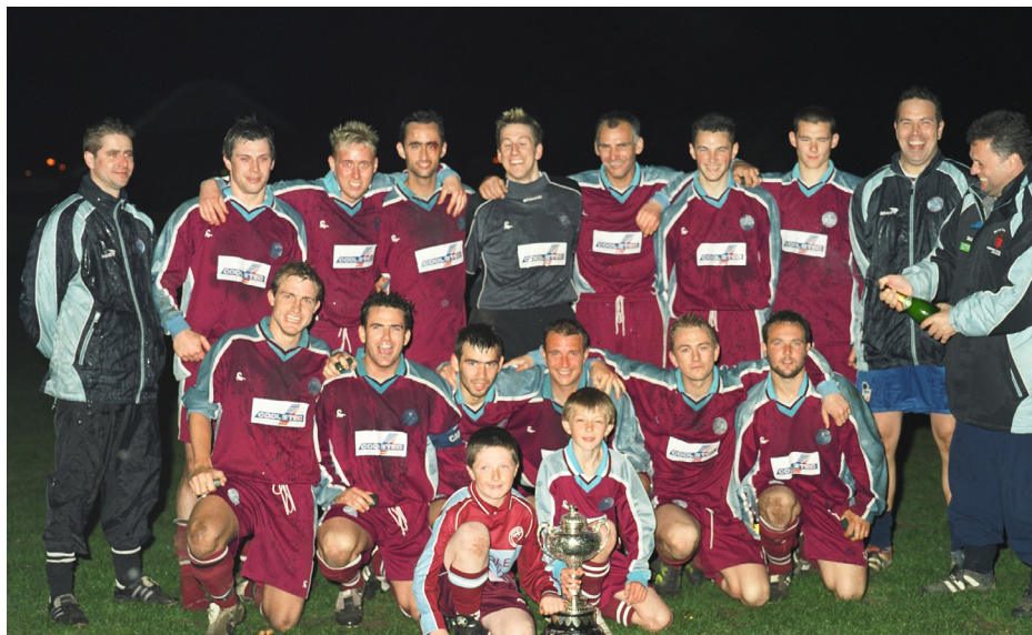
DPL Champions 2003-04