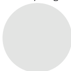
Tristan Plummer Available