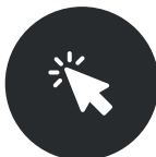
Choose Your Player Online