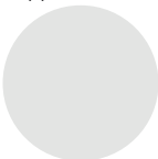
Troy Simpson Available