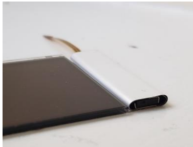
Properly rolled -01