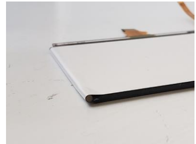
Properly rolled -06