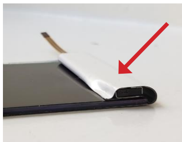
Damaged -03 unit