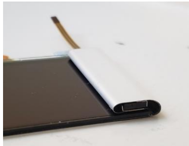
Properly rolled -03