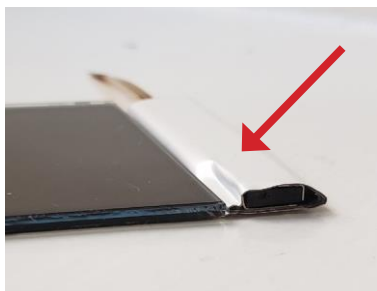
Damaged -01 unit